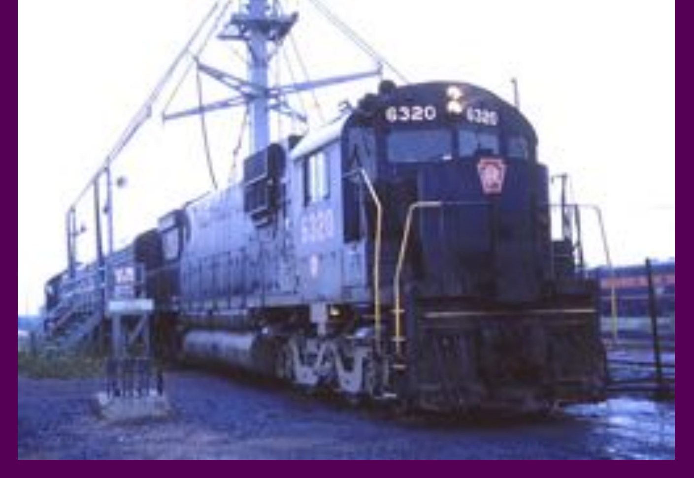
Pennsylvania RR #6320 at West Detroit, Michigan on 14 August 1968. - need better photo