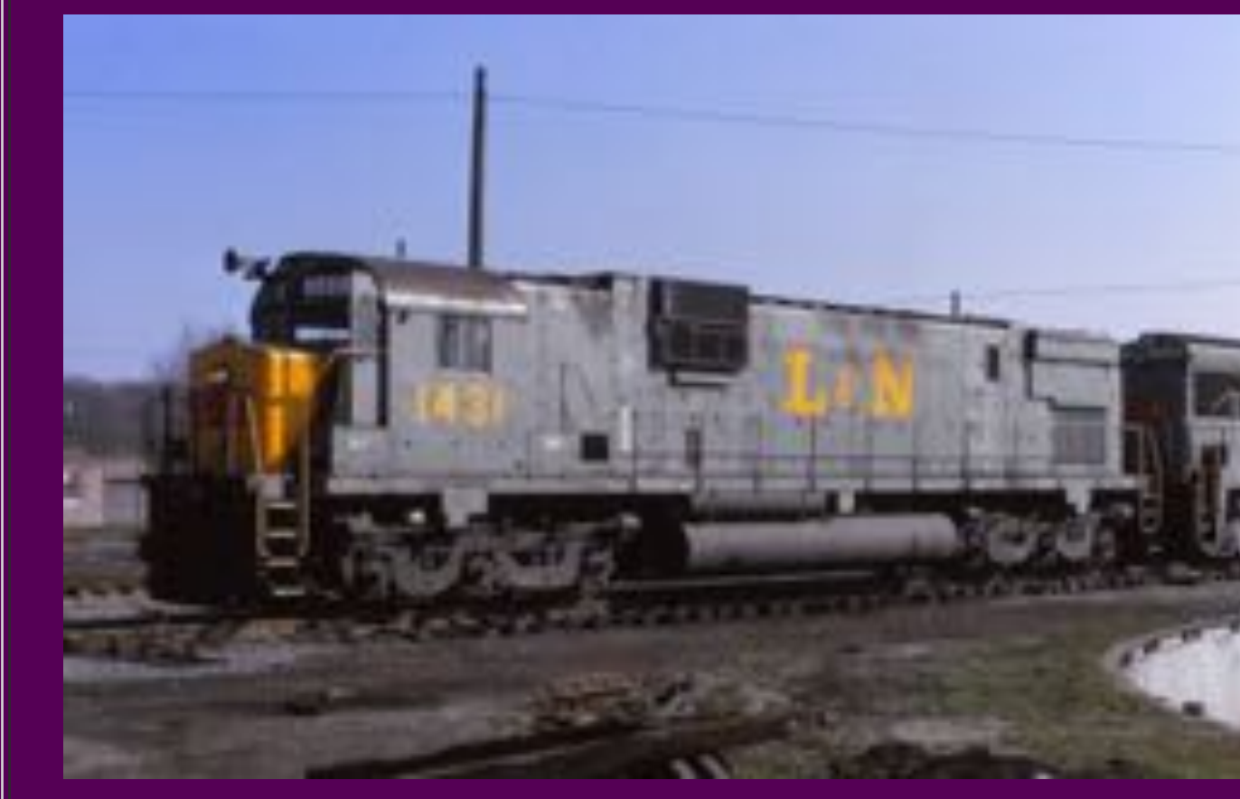
Louisville & Nashville #1431 at Sharonville, Ohio on 19 April 1974.