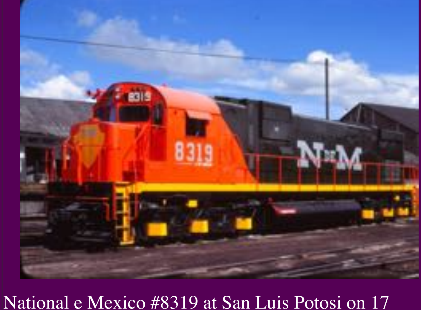
August 1979.