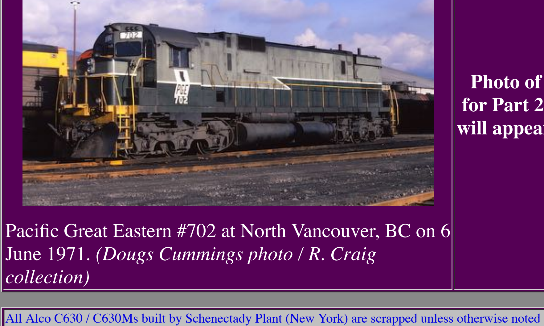
Original Buyer Road No. 2nd Owner 3rd Owner