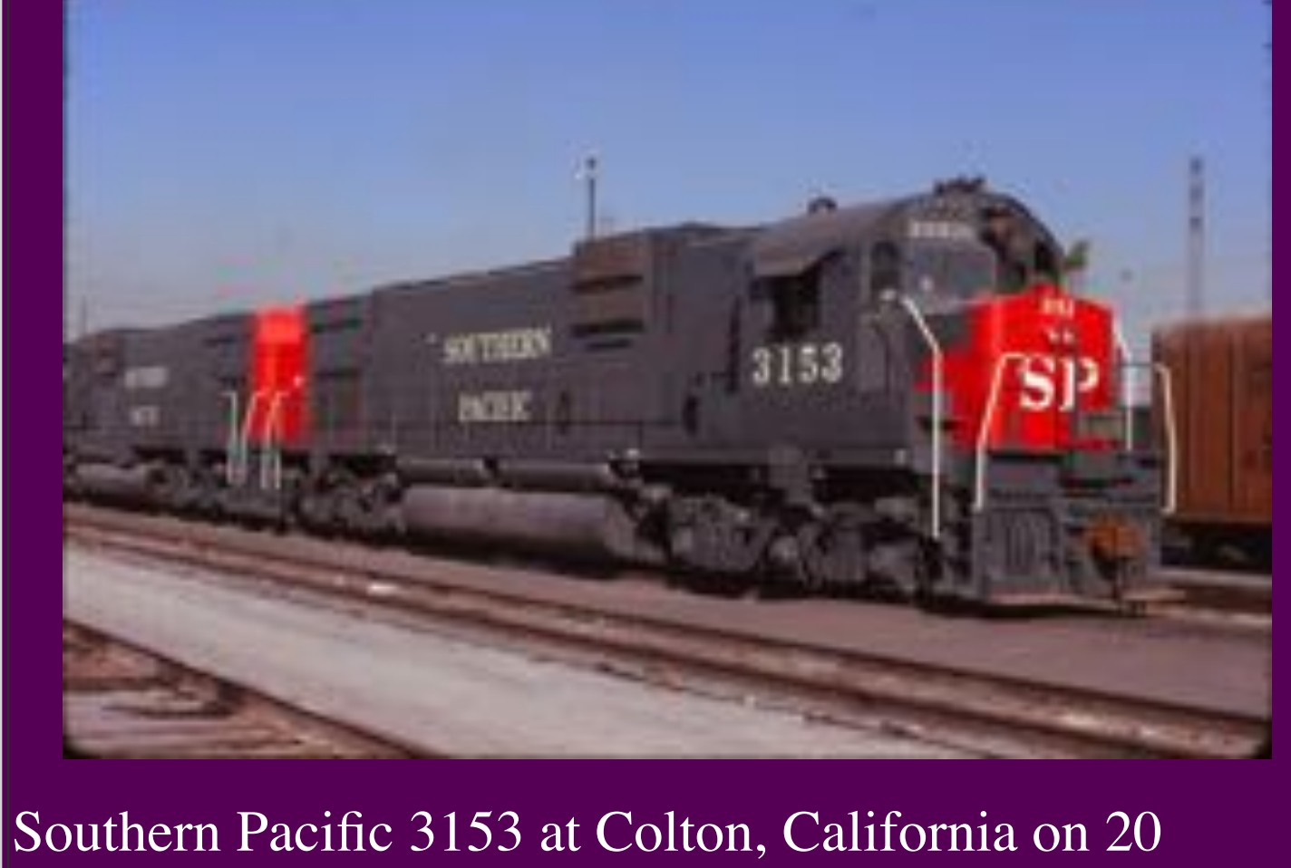
October 1973. C630M: Original Owners