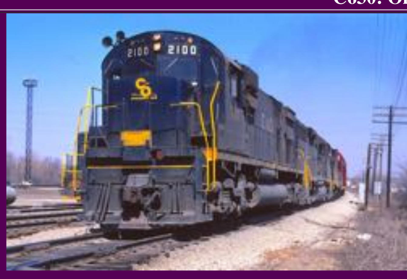
Chesapeake & Ohio #2100 at Grand Rapids, MI on 7 April 1971.