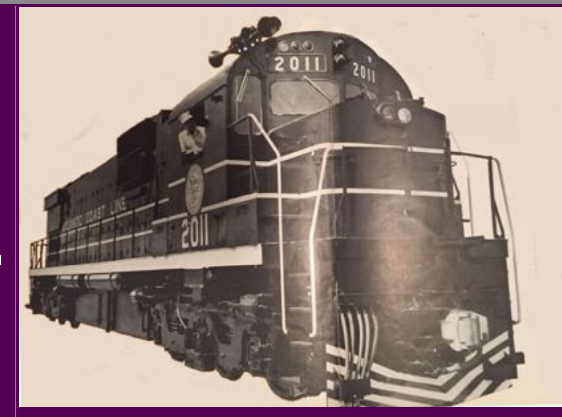
Trains Magazine photo (December 1965)

New: 1 January 2021 In the Fall of 1964, Railway Age magazine and Trains magazine ran an Alco advertisement touting the company's latest high horsepower locomotive. The headline read, "The Jones Already Have One;" the ad was referring to the Schenectady Builder's new Century 630 being used on the Atlantic Coat Line. More specifically, the six-axle freight hauler was the first alternator-rectifier diesel locomotive to be placed in revenue service on a major North American railroad. An AC transmission / traction system provides significant locomotive-operation improvement. First of which is approximately 100 per cent greater adhesion level, next comes lower maintenance costs, and lastly increased reliability. The engineering achievement was one more in Alco's long line of pioneering advances.