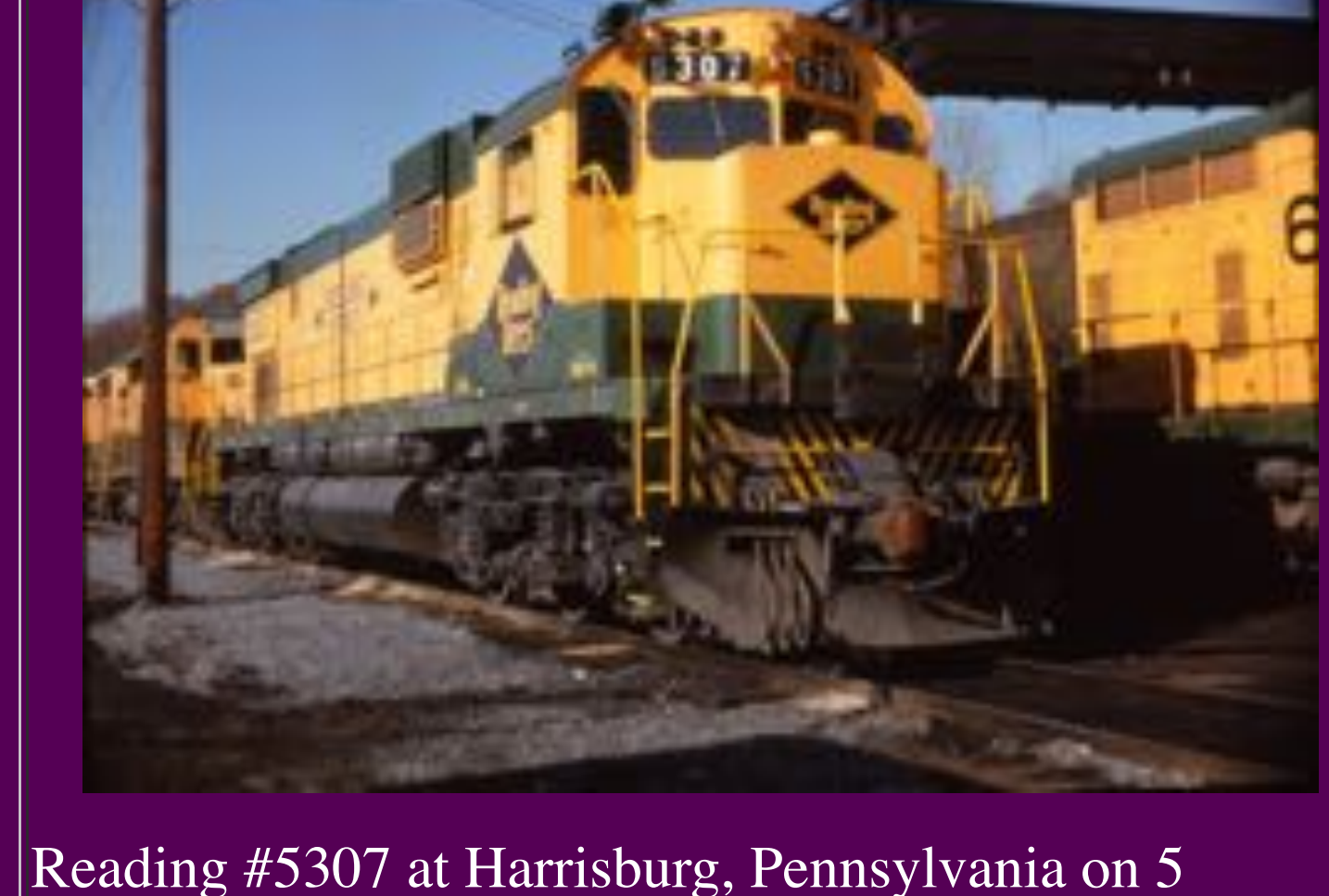
November 1967.